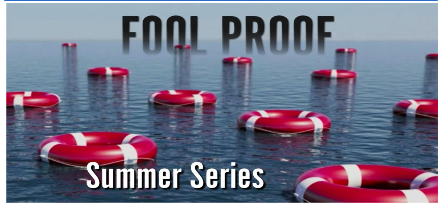
Scripture - Proverbs 15:10 (accept reproof and correction); 15:22 (seek counsel); 19:20 (listen to instruction)

At Assumption, we preach in message series where we dive into a topic over several weeks.