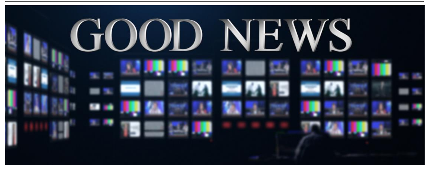
In the Gospel, Jesus warns the disciples that trouble is on the way. When we go through times of trouble, it does not catch God off guard. God knows of our problems. Jesus warns us to persevere through those times.

Small Group is where our large church gets small. Groups are 6-10 people who meet to discuss faith, go deeper in the weekly message, and support one another in their relationship with Christ. This is the place to care for others and be cared for; a place to impact our community and the world. Assumption small groups are open to accept more people anytime during the year to help your faith journey. If you like to join a small group, stop by at the Welcome Desk in the church lobby on Sunday or email rptak@abvmcentereach.com to sign up.