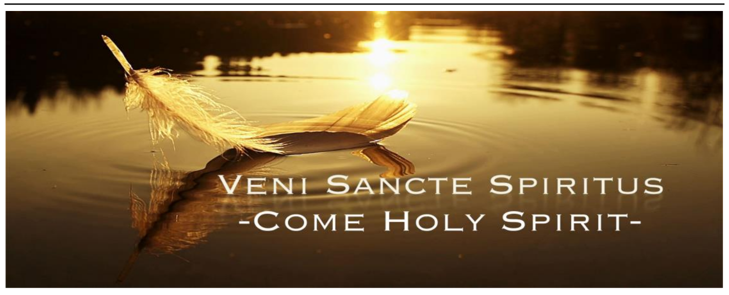
Week 1 Scripture: John 14:16-26

Our goal for this series is to help you want more of the Holy Spirit so that you invite the Holy Spirit into your life