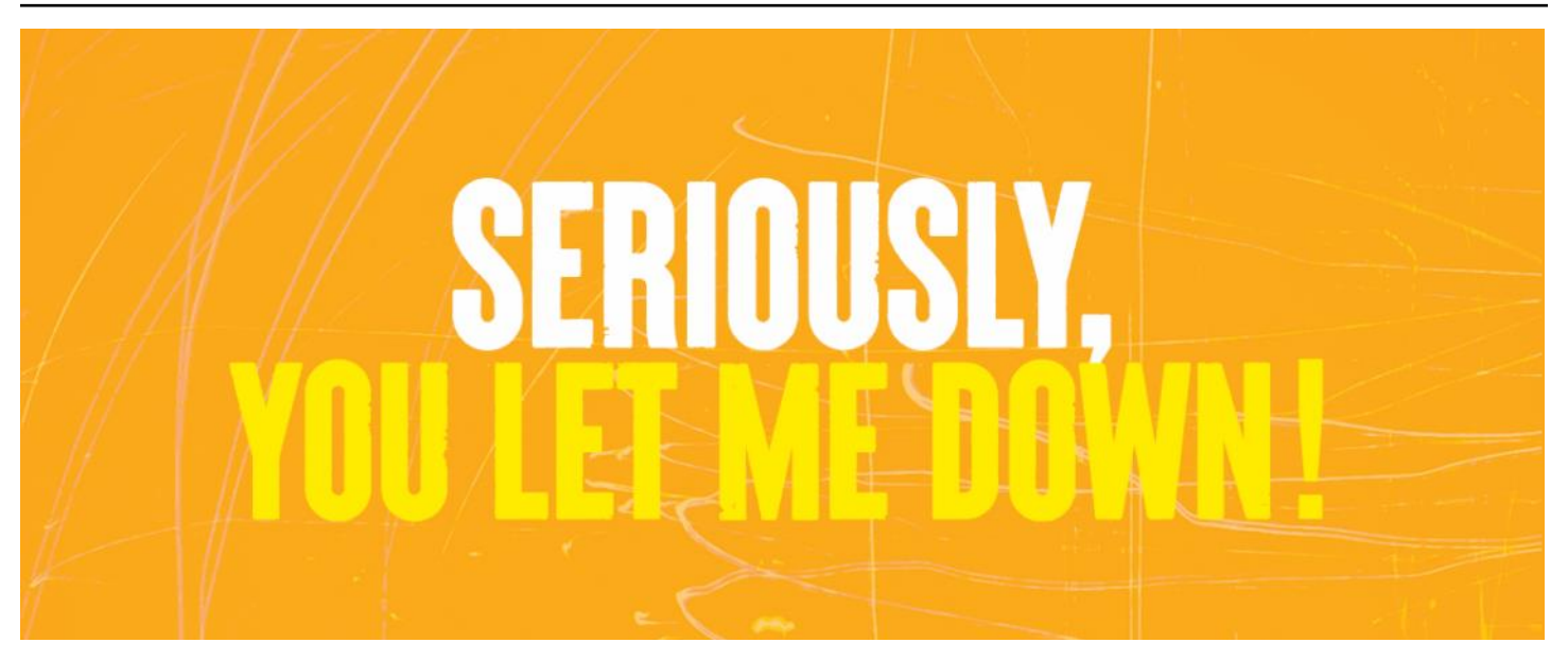
Week Three - Seriously, You Let Me Down